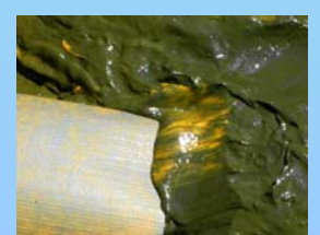
Final Waste Sludge