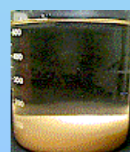
10 Min Settling