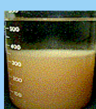
5 Min Settling